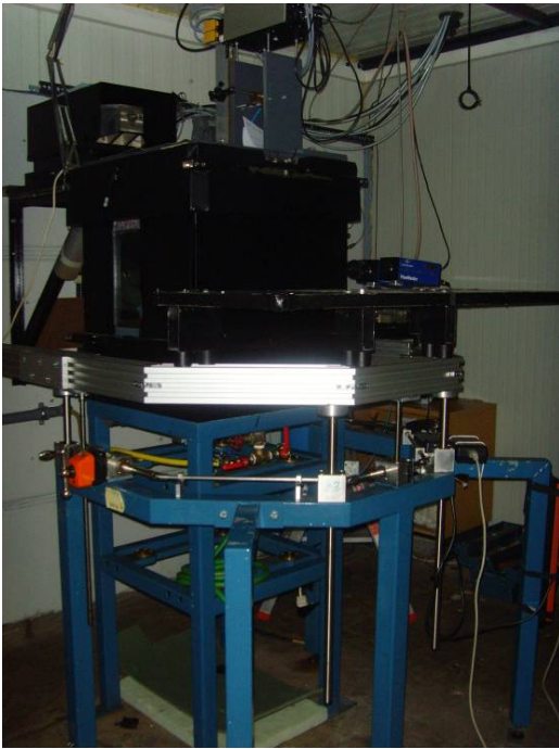
Figure 5: General view of the oxygen transfer facility