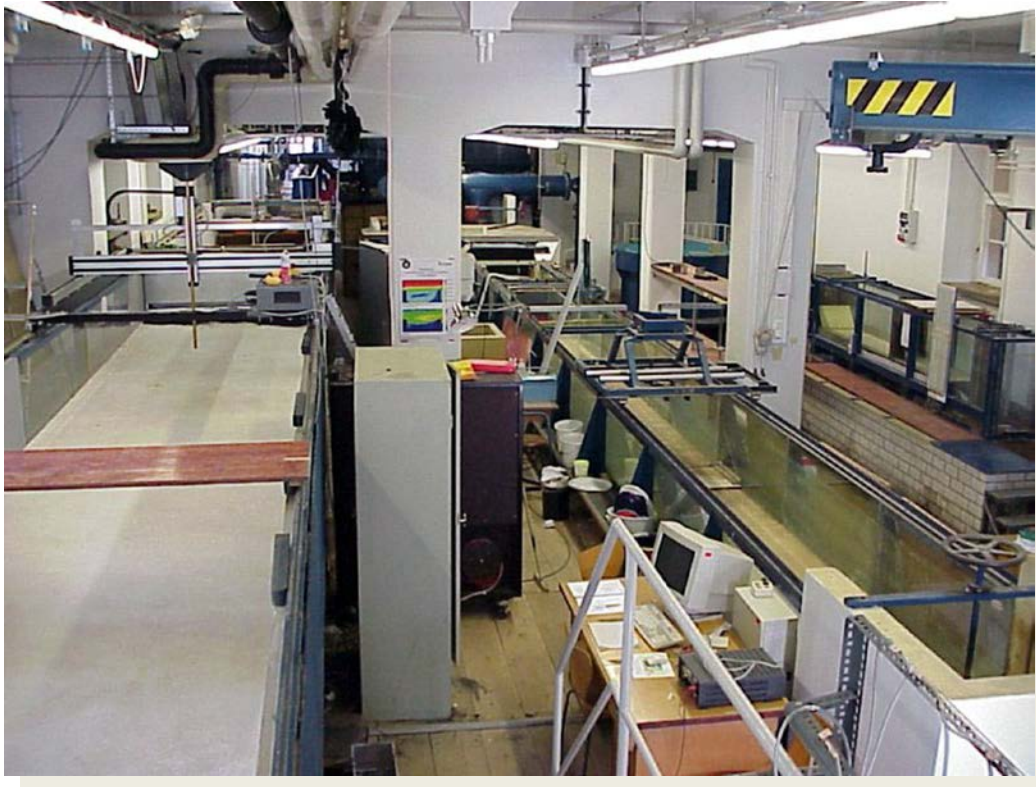
Fig. 4: Flumes No. 1 (left), 2 (middle) and 5 (right)