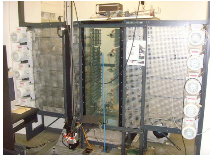
Figure 6: General view of the Turbulent Differential Column