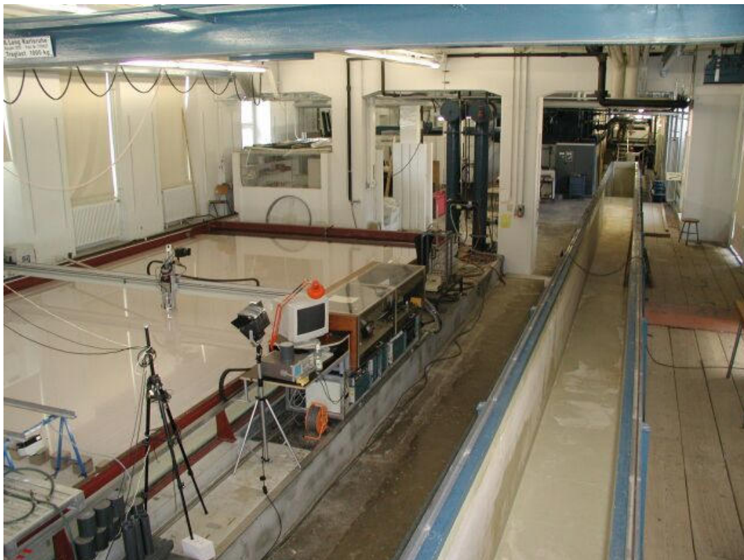
Fig. 3: Shallow Water Basin (left) and Flume No. 3

Detailed Description: Carl von Carmer, Shallow Turbulent Wake Flows: Momentum and Mass Transfer due to large Scale Coherent Vortical Structures, Ph.D. Thesis 2005, http://www.uvka.de/univerlag/volltexte/2005/69/